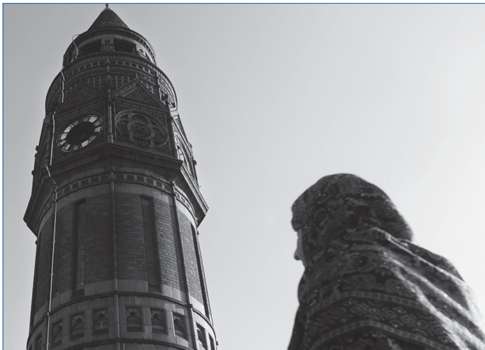
The Green Lane Mosque.