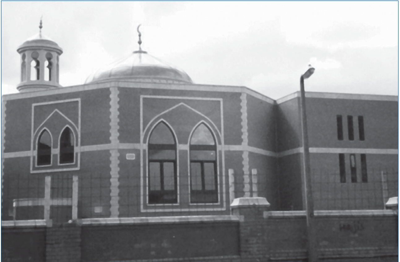
Central Mosque of Rochdale.

– whole generations started to carry our banner with enthusiasm and great care.