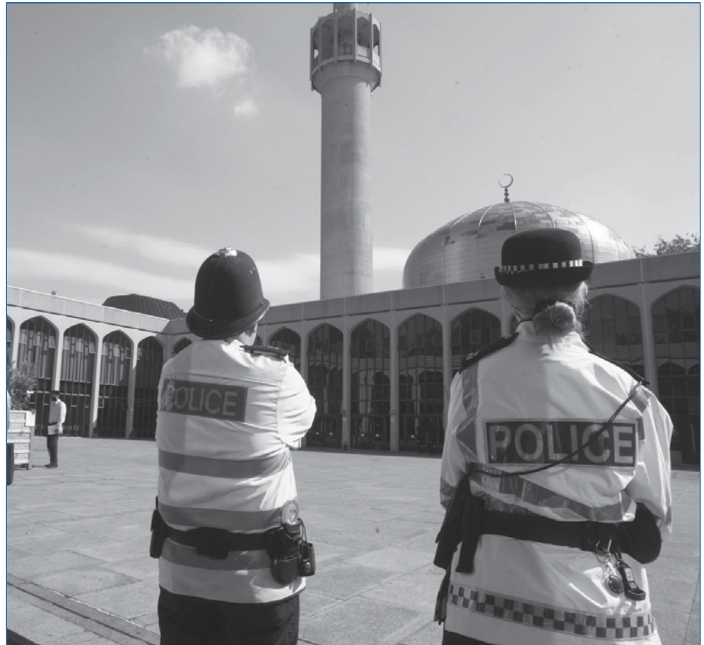
The Central London Mosque.