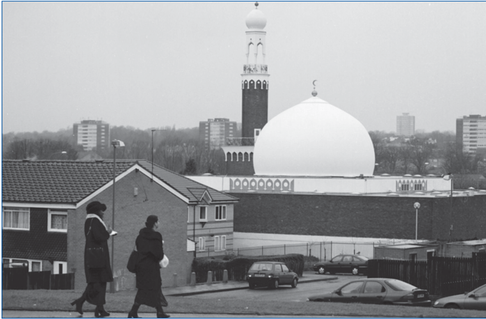
Birmingham Central Mosque.

Committee of the Muslim World League, the Permanent Committee of Jurists, and the Committee for the Supervision of Missionaries, and the Permanent Committee for Islamic Research and Fatwas.