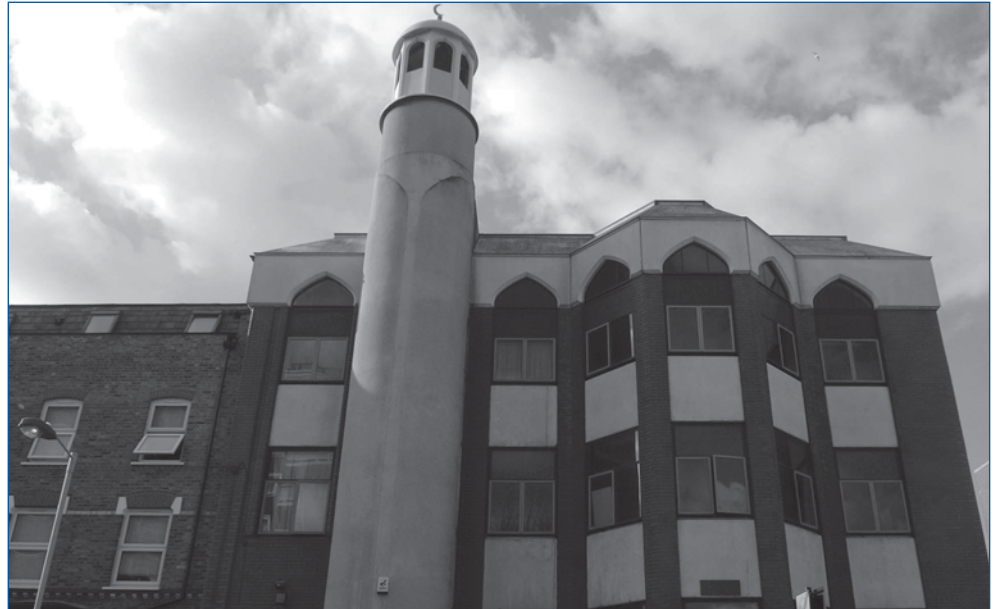
Finsbury Park Mosque.

cal Islamist, Abu al-A'la al-Mawdudi, the man who created the Jamaat-e-Islami political party. Running through the text is an insistence on a separatist philosophy for Muslims that impinges on all areas of life, but is particularly divisive in one respect; namely, allegiance to the country of which a Muslim is a citizen. This is made clear in the following short passage.