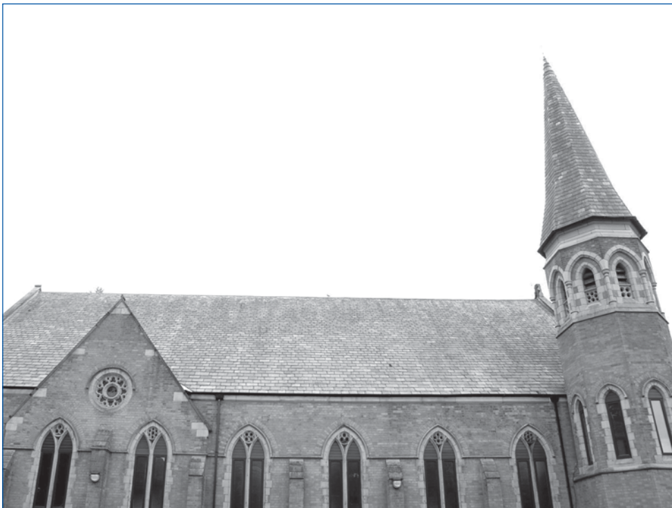
Didsbury Mosque.

These uneducated, narrow-minded unbelievers and the followers of these people believe that the female who gets out of the house and works alongside males has the same rights as men. In this reality, these people have lost belief, faith, and human values. On the other hand, a very commonly seen example [that women should not work] is that females during their menstrual cycle, during pregnancy, and during and after childbirth are unable to perform hard work. If both men and women work outside of the home then who will take care of the children, who will feed the newborns and toddlers, who will cook meals for the males when they come back home after work? If you hire a man to do all of this work and pay him then that man will cause idleness. Because of this idleness, these females are stepping out of their houses and working. Females leaving their homes and beginning to work and following in men's footsteps is causing both loss of human values and loss of faith at this time.