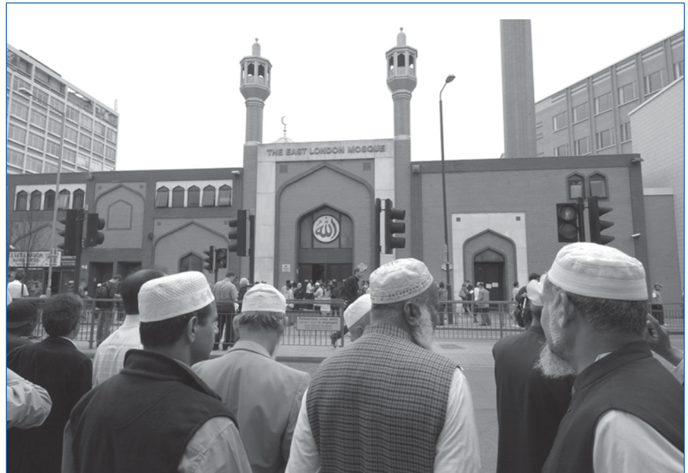
East London Mosque.

A long and a short invocation are provided. Other medieval sources are referred to, before the author continues: